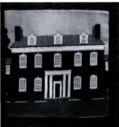
Above and throughout this annual report are squares from the centennial quilt, hand-crafted by staff, alumni, teachers, parents and friends of the school in honor of our 100th anniversary.