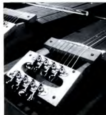
Above, top: cloud-chamber bowls, an audience favorite; bottom: detail of the surrogate kithara.